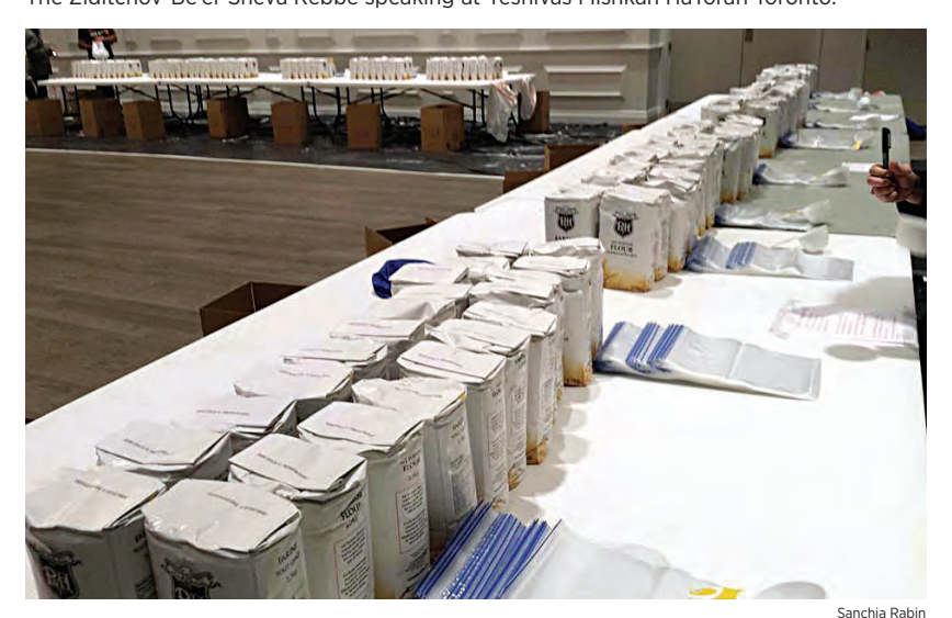
Bags of flour ready for the Toronto Challah Bake.