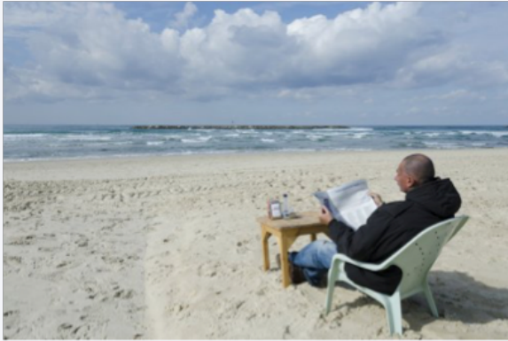
Man at beach cafe reading newspaper, Jerusalem beach on January 18, 2012 in Tel Aviv, Israel.

by Tiffanie Wen Apr 14, 2013 4:45 AM EDT